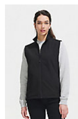
SOL'S RACE BW WOMEN 02888